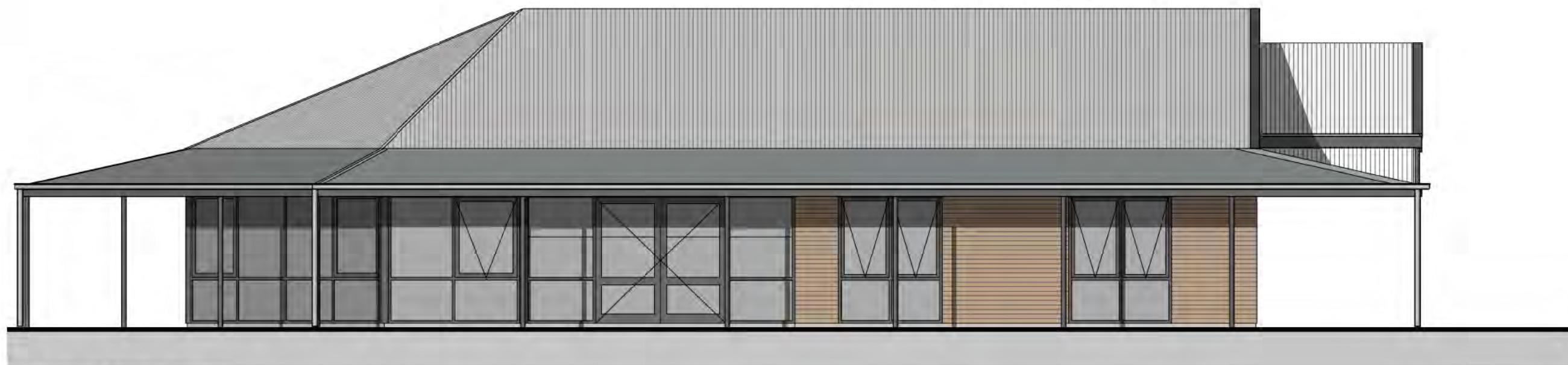
1 North Elevation 1 : 75