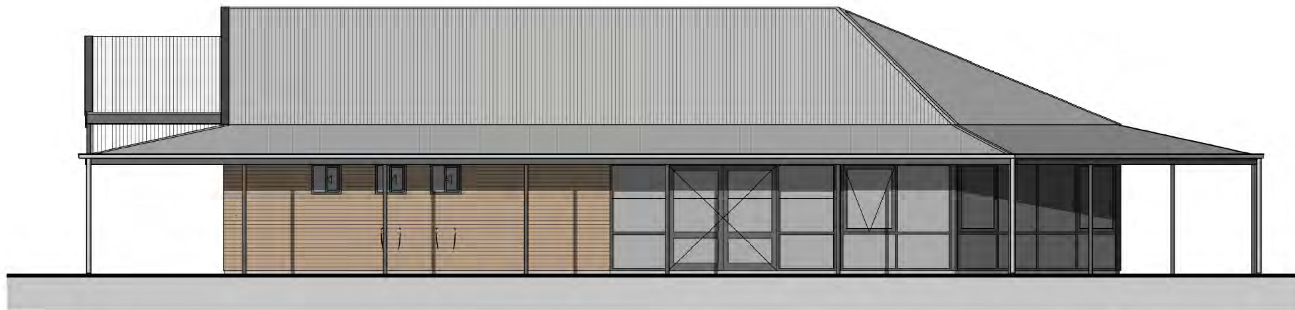
1 South Elevation 1 : 75