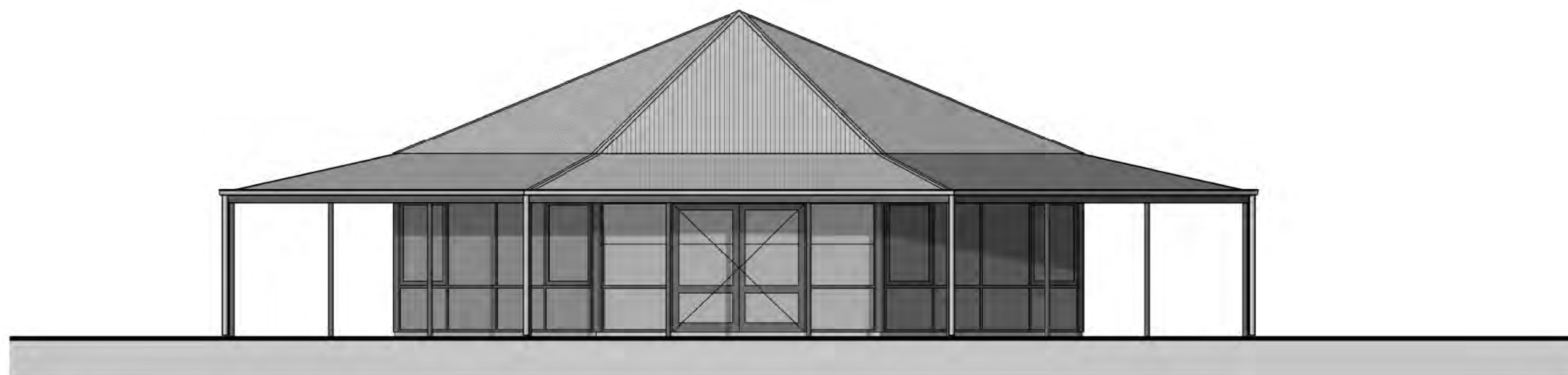
2 East Elevation 1 : 75