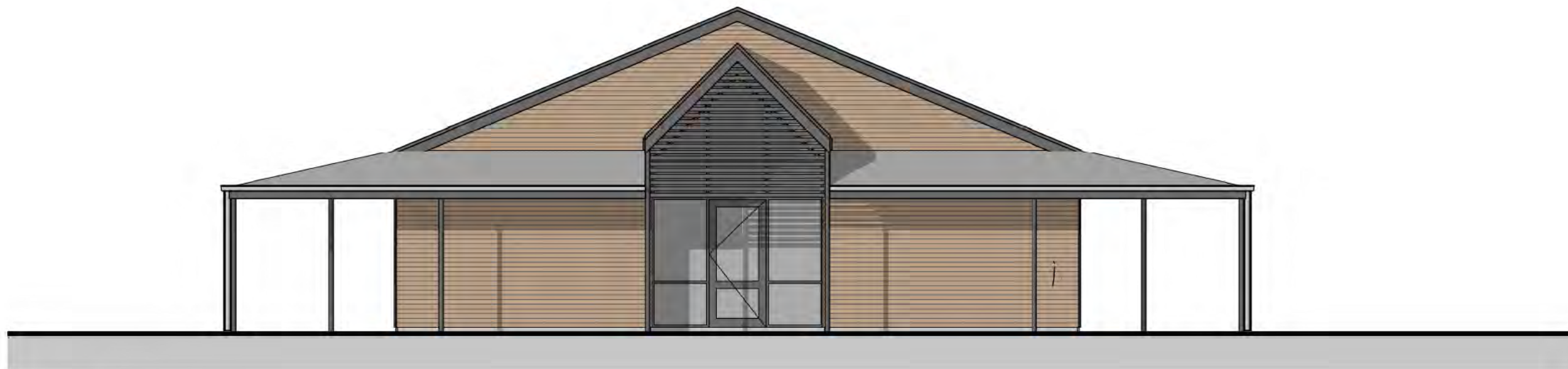
2 West Elevation 1 : 75